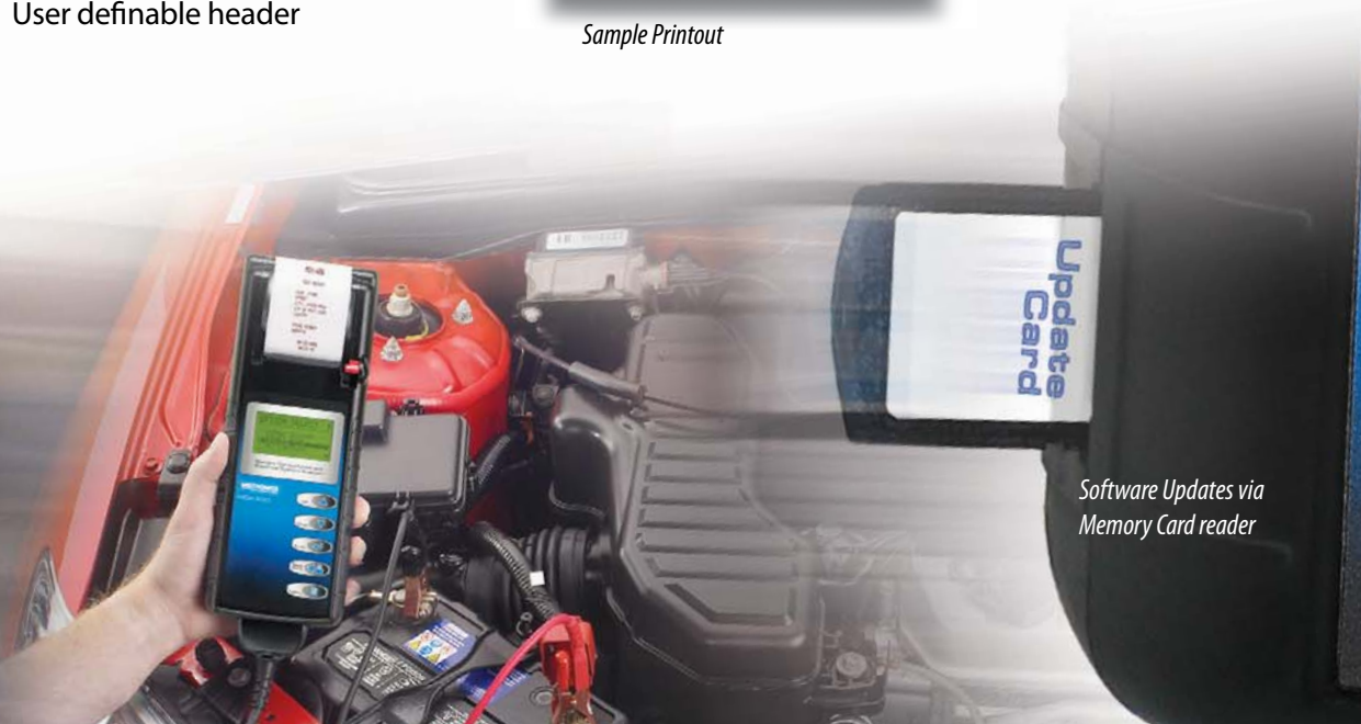
Software Updates via Memory Card reader