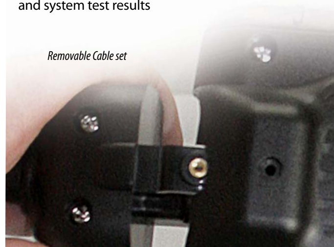
Removable Cable set